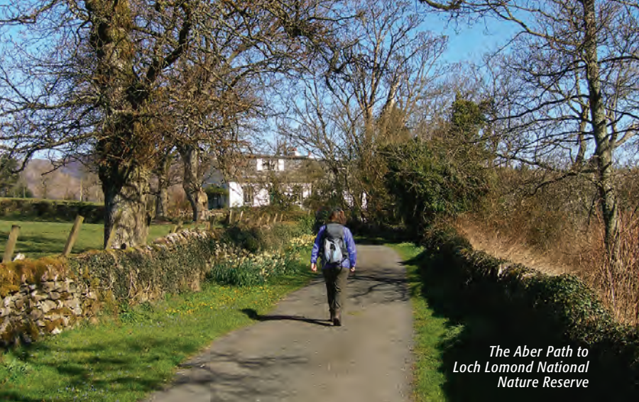
The Aber Path to Loch Lomond National Nature Reserve