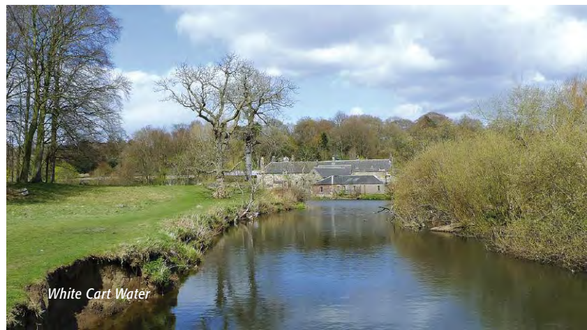
White Cart Water

Access & Parking free Parking charge at Burrell Collection