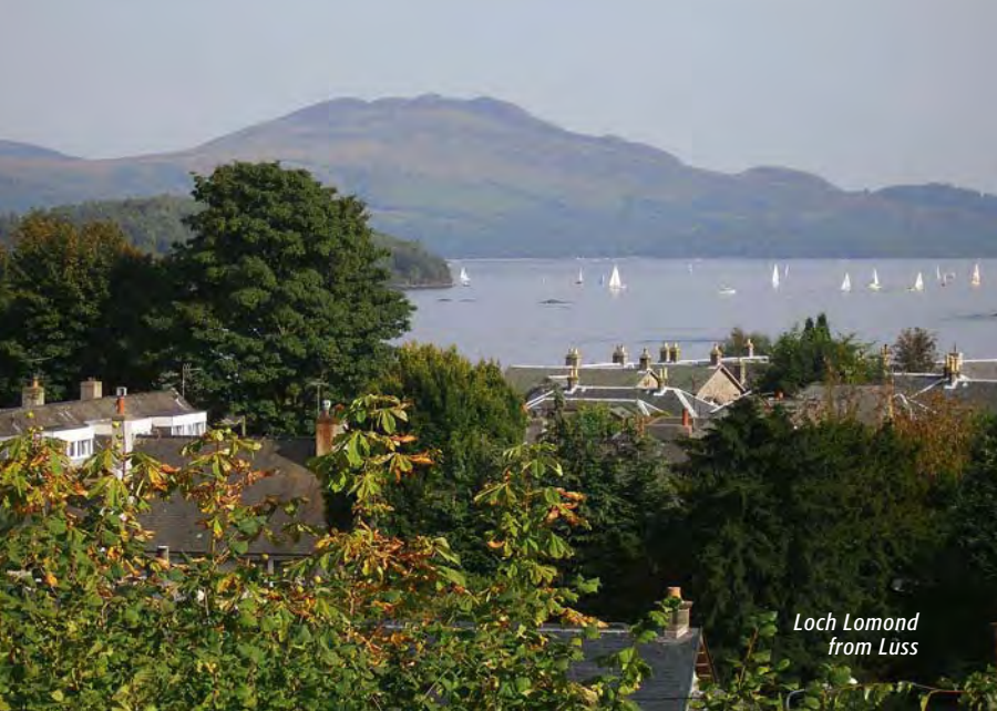
Loch Lomond from Luss